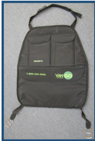
Emergency forms in black saddle bag