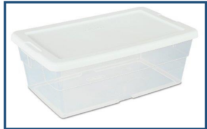
Emergency equipment in cargo space

Pick up your NEW shovel before you leave! (One per van)